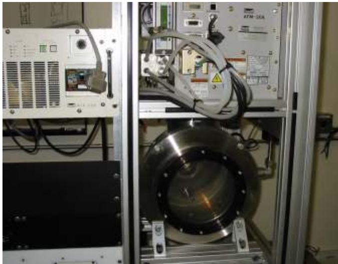
In-house Microwave-Assisted CVD Unit

Hadron engineers have worked extensively on the plasma/thermal spray thick film coatings for metals, ceramics, and graphite. These spray techniques are amenable to a wide range of film compositions, depending on the requirement for a particular application.